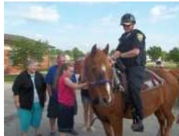
EMS Open House